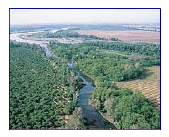
The Colusa Subreach includes important flood management, water supply, agriculture, recreation, and wildlife habitat uses

On behalf of the Sacramento River Conservation Area Forum and The Nature Conservancy, "Thank you" to everyone who shared their time and opinions.